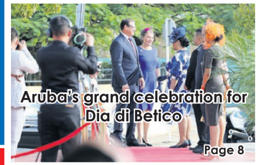
Aruba's grand celebration for Dia di Betico